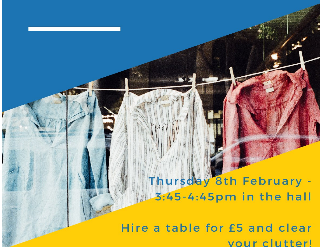
TABLE TOP SALE

Thursday 8th February - 3:45-4:45pm in the hall